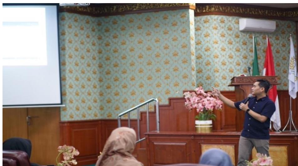
Figure 1. Implementation of Activities